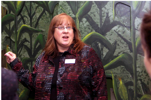
A member of the Discovery Center staff

Today we met at the Discovery Center Museum in downtown Rockford. We had a fun time as we toured the new addition space and we were able to see the current traveling exhibit, Grossology.