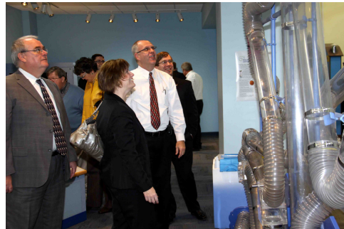
Fun air tubes